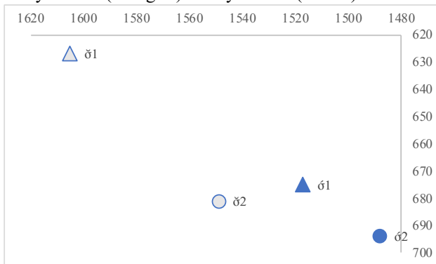
Figure 1: Formant distribution of stressed (darker shades) and unstressed (paler shades) /a/ in syllable 1 (triangles) and syllable 2 (circles).

In the case of /i/, the MANOVA indicated that there was a significant effect of ‘syllable position’ for both F1 ( F = 4.529, p = .036 ) and F2 ( F = 49.785, p < .001 ), the first of which accounts for 5% and the latter for 36% of the residual variance. Closer inspection of the Mean unstressed F2 values (see Table 2 ) provide some explanation for this finding: the F2 value of unstressed /i/ in Syllable 2 is notably centralised in our dataset. This is likely due to /i/ being followed by retroflex segments in all tokens in this position, resulting in a lower F2 value for the target due to anticipatory co-articulation. There was also a significant effect of ‘stress’ for F2 ( F = 30.462, p < .001 ) (here, accounting for 25% of the variance). There was a significant interaction for both F1 ( F = 4.315, p = .041 ) and F2 ( F = 5.809, p = .018 ); see Figure 2 .