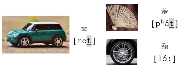
Figure 1: Example of Thai final Phoneme identification test. (No orthography was used to avoid an orthography effect).

This task tests the ability to identify an existence of corresponding categories at phonological levels [28]. The task involves identifying of phoneme (initial or final) in the target word if it matches one in either A or B. The examiner gave three pictures, one target picture for the matching and the remaining two are choices. The child had to choose between A or B that matches in either initial or final consonant with the target. Figure 1 illustrates the target picture [rót] on the left and the two choices on the right, the task was to match the corresponding final consonant. The correct answer is “ พัด [p h át] ‘folding fan’”.