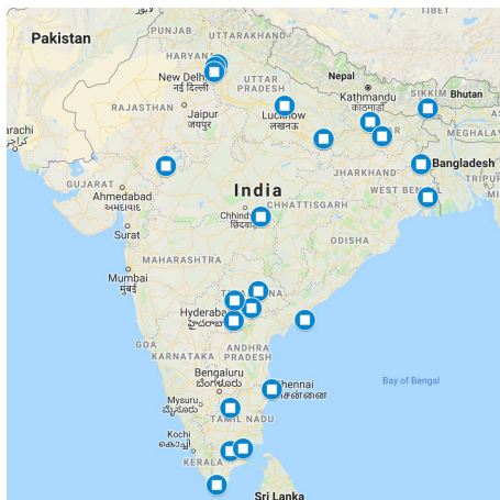
Figure 1: The participants' places of birth in India.

collection, identified as bi- or multilingual, and reported no hearing problems. They had all moved to the city for the purpose of tertiary education and none were born in Hyderabad. Fig. 1 shows the participants' places of birth.