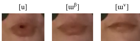
Figure 1: Frontal lip positions at vowel midpoint for the three vowels at issue for S44.

sion in a vowel with a similar but distinct acoustic quality that we transcribe as [u β ]; and fricative-like labiodental constriction in a vowel we transcribe as [u v ]. Typical lip positions for each vowel are shown in Figure 1. The latter two vowels can be said to continue the constriction type of the consonants that obligatorily precede them: [u β ] occurs only after bilabial stops /p, p h , b/, and [u v ] occurs only after labiodental fricatives /f, v/ [25, 16]. On distributional grounds, [u] and [u β ] are in fact contrastive (though [u] and [u v ] are allophonic): although [u β ] is restricted in its occurrence, [u] may occur in the same environment, and minimal pairs are easily found (see Table 1).