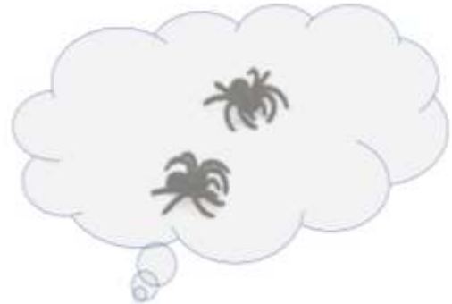
Figure 1: Picture to elicit the utterance Ik ha twa spinnen hân ‘I have had two spiders’.

We hypothesize that the nasal in the plural is longer than in the singular because the plural underlyingly consists of two nasals. We also hypothesize that the nasal in final position is longer than in non-final position, both in singular and plural, due to final lengthening [7]. We finally expect the difference in duration between singular and plural forms to be similar in both final and non-final position.