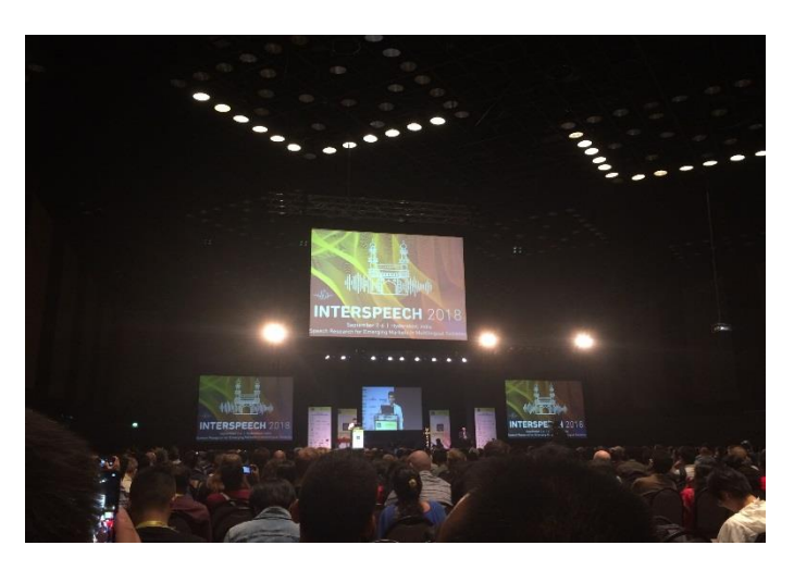
The presenters with the panel of experts at 4th Doctoral Consortium at Interspeech

The official inauguration of Interspeech 2018 was held on September 3, 2018, at Hyderabad International Convention Center, India. This year, 1668 papers were submitted for Interspeech, out of which 749 were accepted, making the acceptance rate as 54.31%. During the inauguration ceremony, detailed statistics about the review