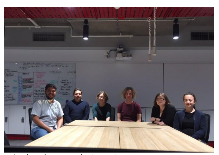
(registration opens in August):

You can read about all of the courses at this link below