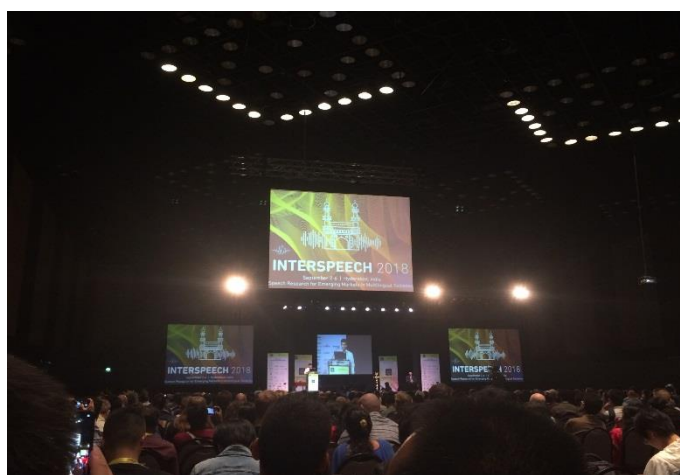
The presenters with the panel of experts at 4th Doctoral Consortium at Interspeech

The official inauguration of Interspeech 2018 was held on September 3, 2018, at Hyderabad International Convention Center, India. This year, 1668 papers were submitted for Interspeech, out of which 749 were accepted, making the acceptance rate as 54.31%. During the inauguration ceremony, detailed statistics about the review