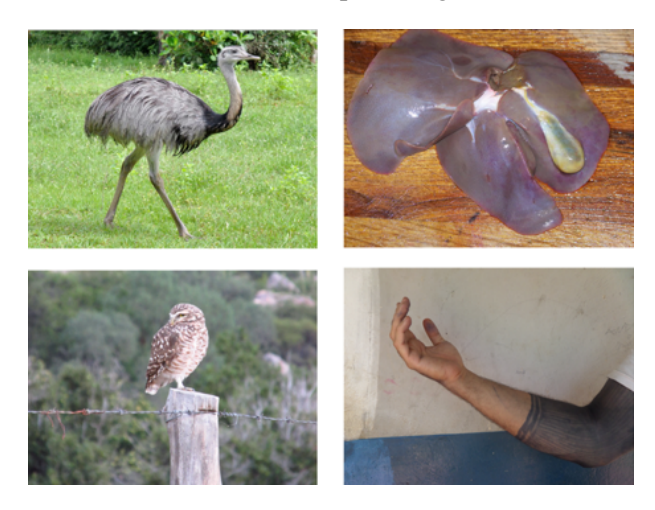
Figure 1: Visual stimuli.

During the task, participants were presented with laminated physical printouts of the four photos shown in Figure 1, each representing one of the target words in (3). Prior to commencing the task, participants were asked to name each picture. The task did not begin until they had pronounced each one of the target words to confirm their knowledge of the lexical items and intended phonological form.