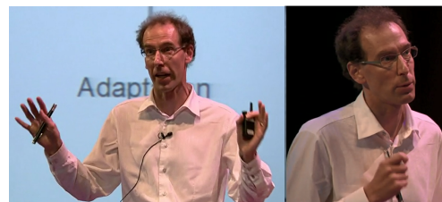
Figure 2: Left panel: “oh yes , I think it’s bad” referring to climate change. Right panel: “That report that landed on President Johnson’s desk...” ( bold indicates pitch accented syllable).

The examples in Figure 2 from Prieto et al. also show that beat-like gestures can convey a variety of intentions and illocutionary forces which can distinguish between asserting, ordering, exclaiming, etc. The two panels show two examples that illustrate the epistemic functions of beat-like gestures. While the open palms facing the speaker (left panel) show low certainty and low degree of imposition, fist beat gestures (right panel) represent high certainty and high imposition.