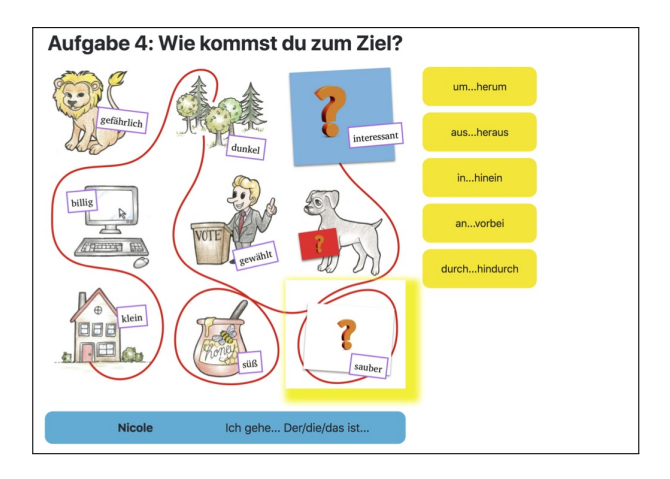
Figure 2: How do you reach the destination?

During the interaction with Mirabella, participants were seated in front of a monitor and recorded in